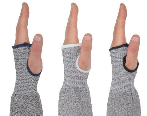
20-S10ATA/PE7-T A7 20-S10ATA/PE8-T A8 20-S10ATA/PE9-T A9