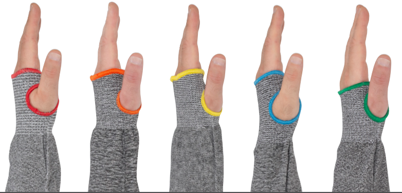
20-S13ATA/PE2-T A2 20-S13ATA/PE3-T A3 20-S13ATA/PE4-T A4 20-S13ATA/PE5-T A5 20-S13ATA/PE6-T A6